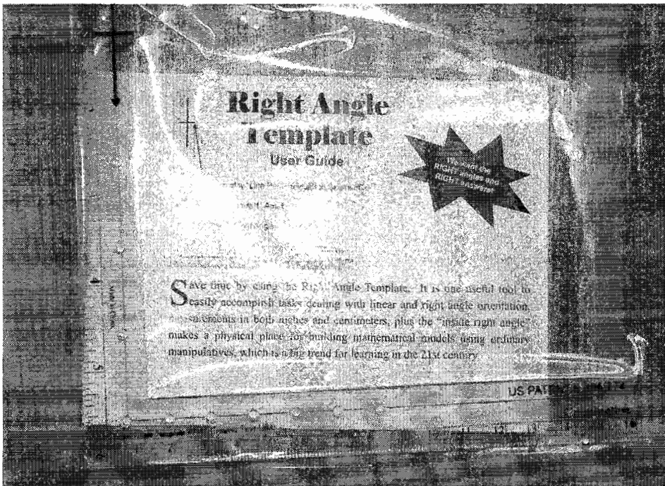
Right Angle Template